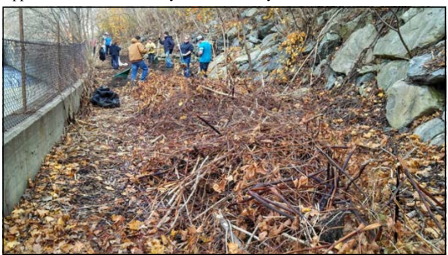
E3 students working on a trail maintenance project

The program coordinator explained that these service learning projects enable students to practice work skills within the safety of the E3 program that they can then utilize in their internships. She said,